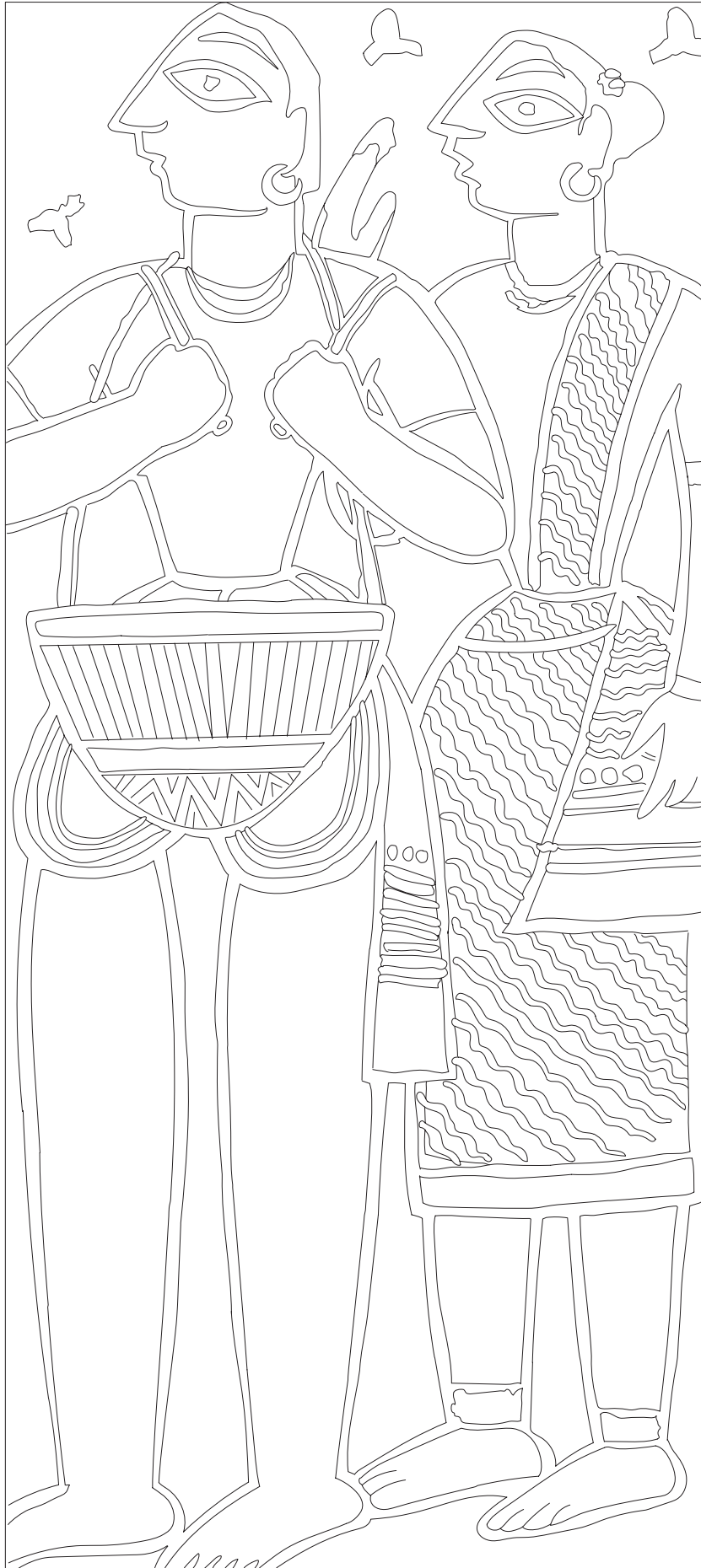
OVERLEAF, Untitled by Jamini Roy

Original Artwork - Tempera on Box Board 23.5" x 10.5" | 1920s