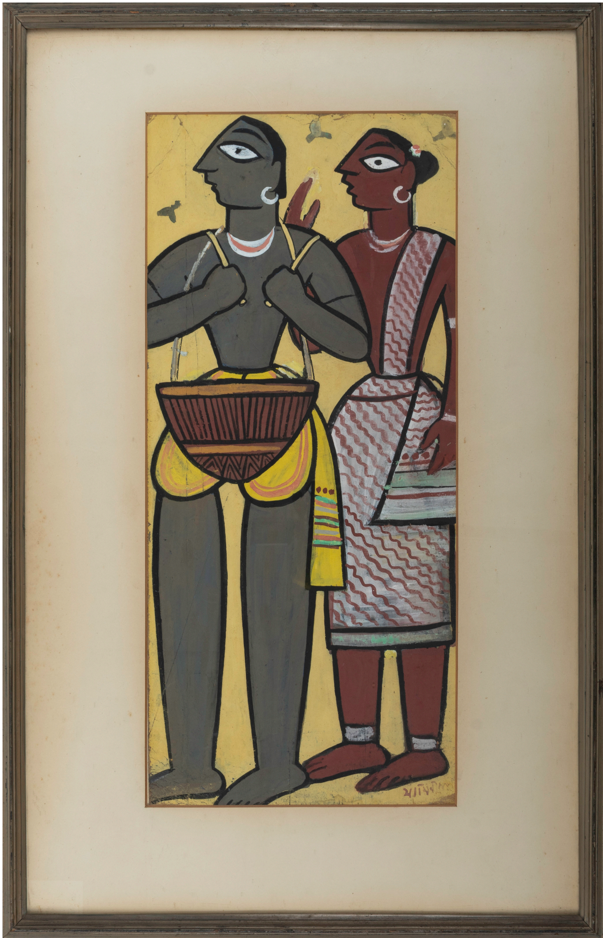
OVERLEAF, Untitled by Jamini Roy Original Artwork - Tempera on Box Board 23.5" x 10.5" | 1920s